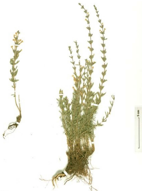
Figure 1. Satureja Sahandica Bornum L. (SSB) , Collected in the central plateau of Iran.

The plant extract has been shown to reduce the expression of the MMPs gene, especially MMP-9 and MMP-13. In this way, alcoholic essence Satureja Sahandica Bornem L. can prevent the progressive destruction of cartilage by preventing the demolition of the extracellular matrix of cartilage (ECM).