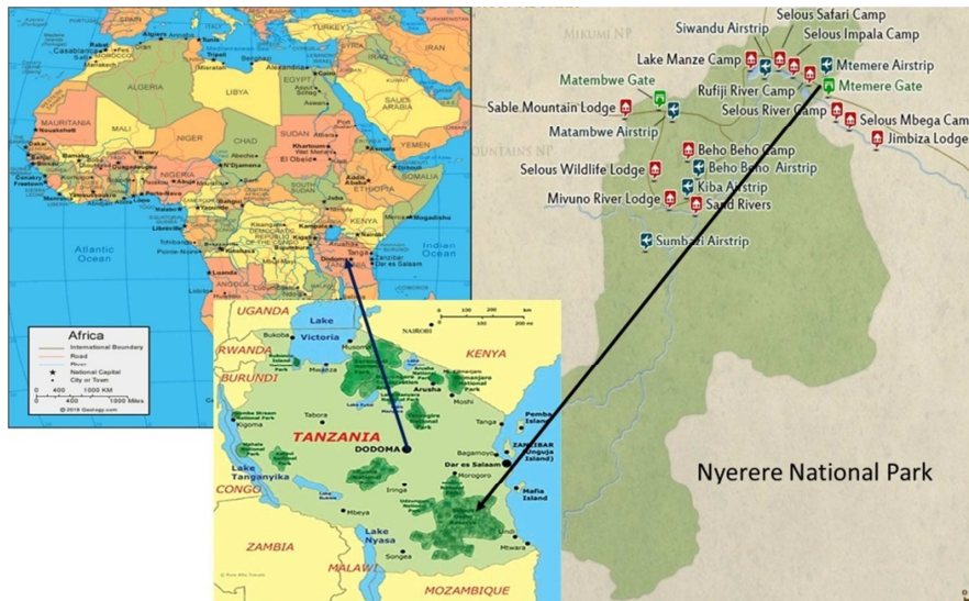
Figure 2. Map of Nyerere National Park.

The economic use value of recreation resources in NNP is not known, therefore this study narrowed this gap of knowledge through estimating the recreation use value of NNP. Information on the recreation use value of NNP would be instrumental in informing policy makers in tourism industry, specifically from Tanzania National Parks (TANAPA) and the Ministry of Natural Resources and Tourism (MNRT) on how to improve tourism activities in NNP and other national parks in the country. In addition, this study is furthering the recommendations given by previous studies which encouraged more valuation studies to be conducted on natural recreation resources in other parts of the country [5, 11, 12].